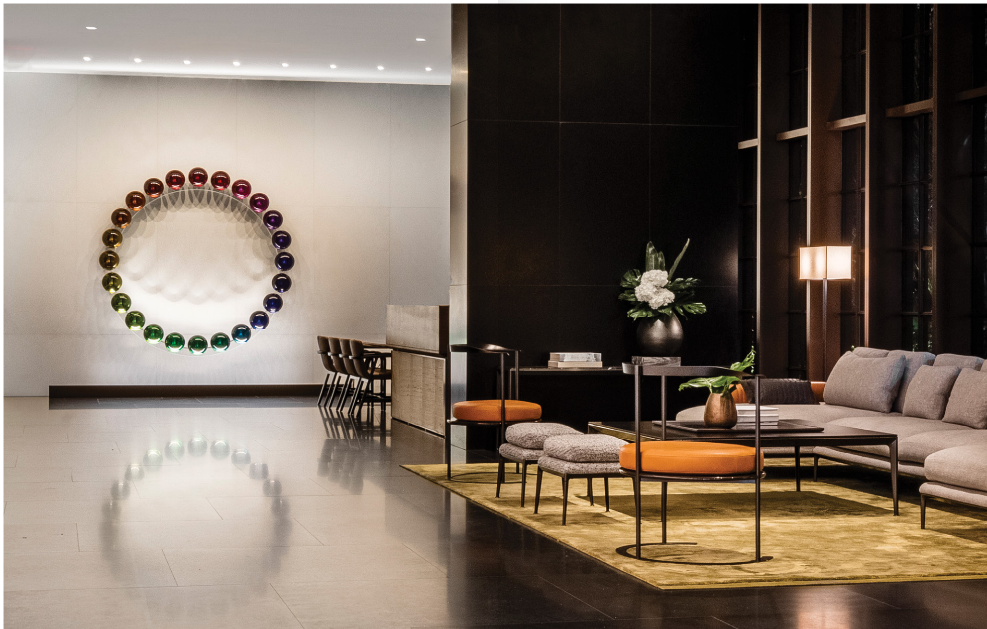
The discreet lobby is furnished with pieces designed by Antonio Citterio, anchored by the entry's centerpiece, Polychromatic Chronology 2016 , by acclaimed artist Olafur Eliasson.