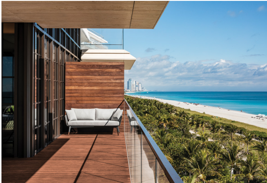
Generous living spaces offer modern, open layouts and vast ocean views from oversized terraces.