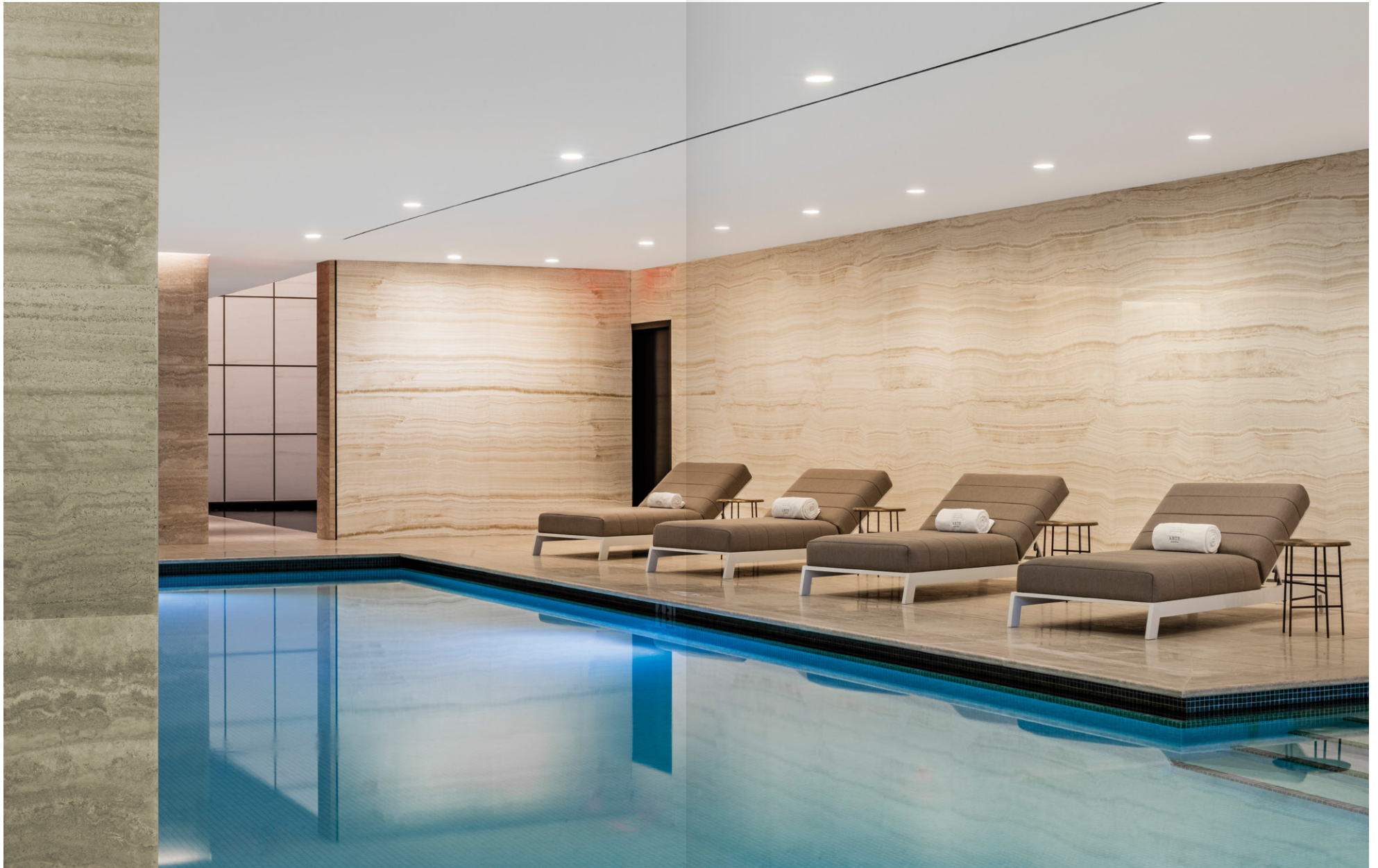
The 75' heated indoor lap pool, with a luxurious travertine deck, allows for year-round aquatic activities.