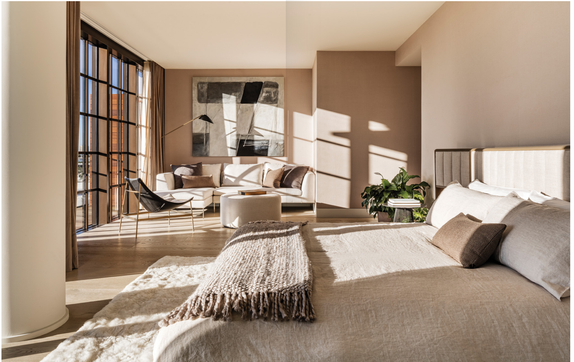
Corner master bedroom suites feature private terraces and enjoy dramatic views through expansive apertures.