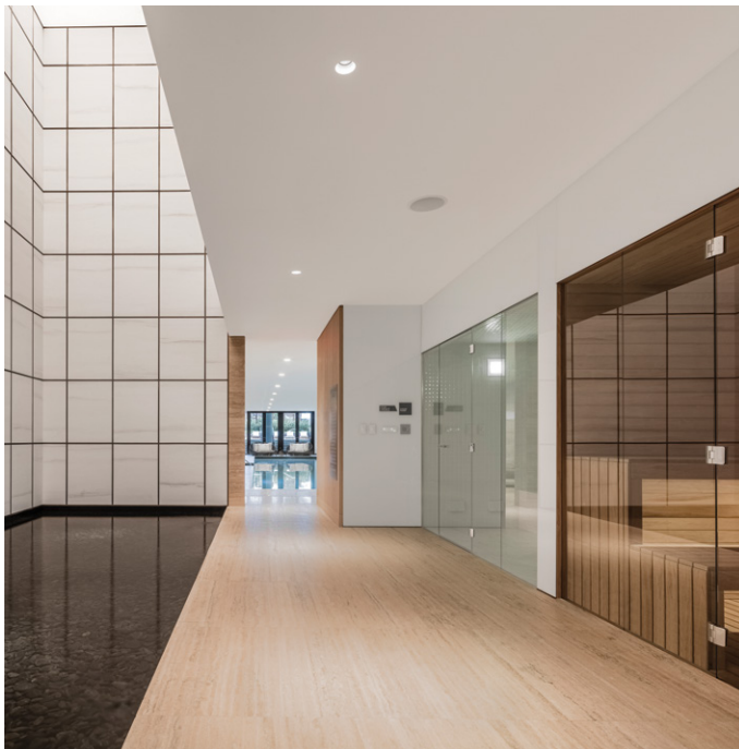
Sauna, steam room and spa water feature.