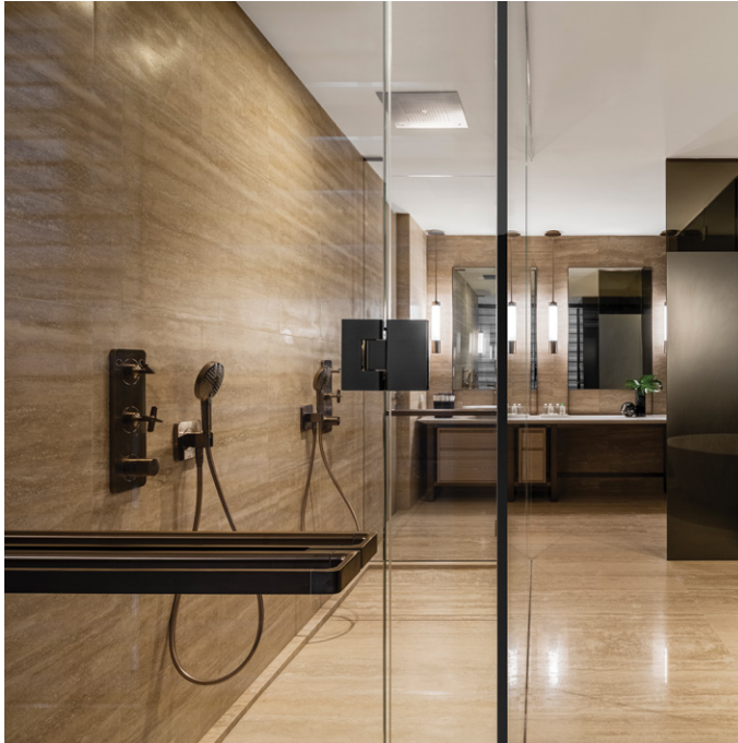
Gracious master baths a feature full-height glass shower, sculptural stone soaking tub and Roman travertine floors and walls.