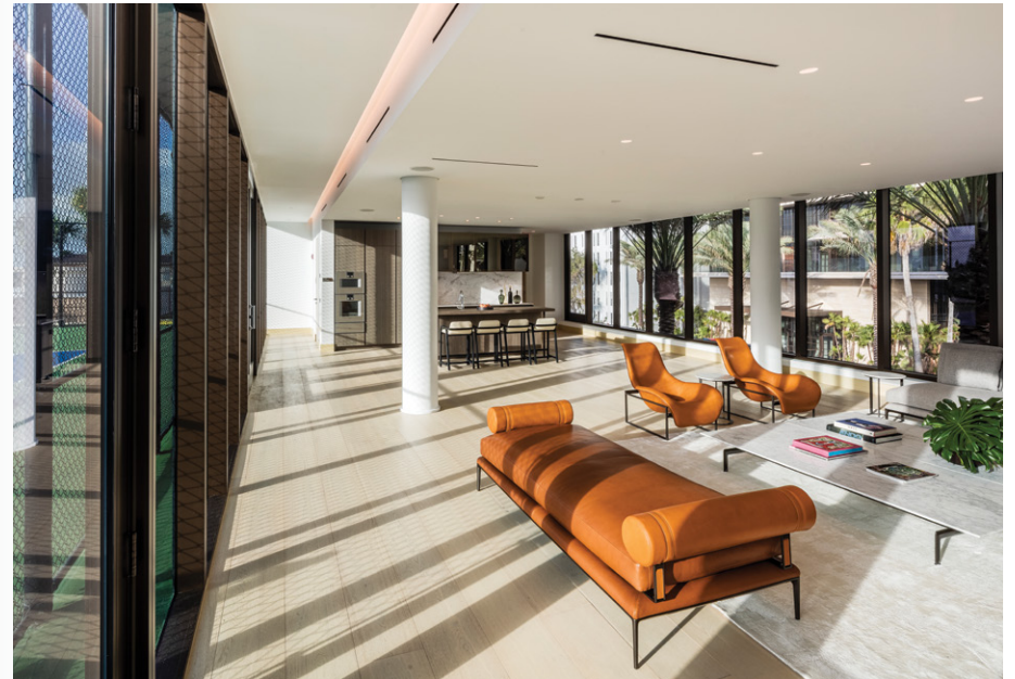
The private rooftop tennis court offers a gracious arena for leisure athletic pursuits while the adjacent residents' lounge features a chef-worthy catering kitchen dedicated to out-of-home entertaining.