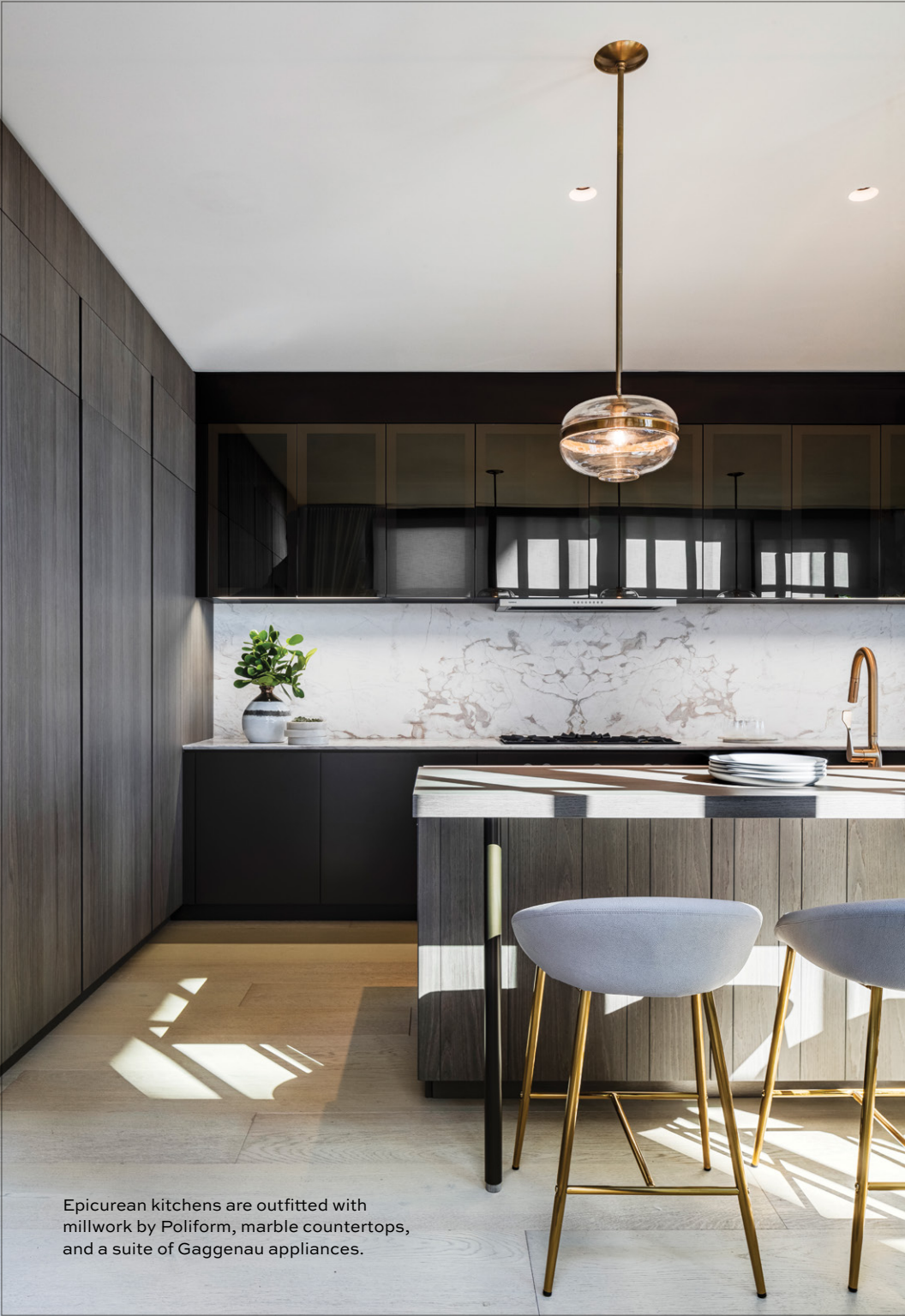
Epicurean kitchens are outfitted with millwork by Poliform, marble countertops, and a suite of Gaggenau appliances.