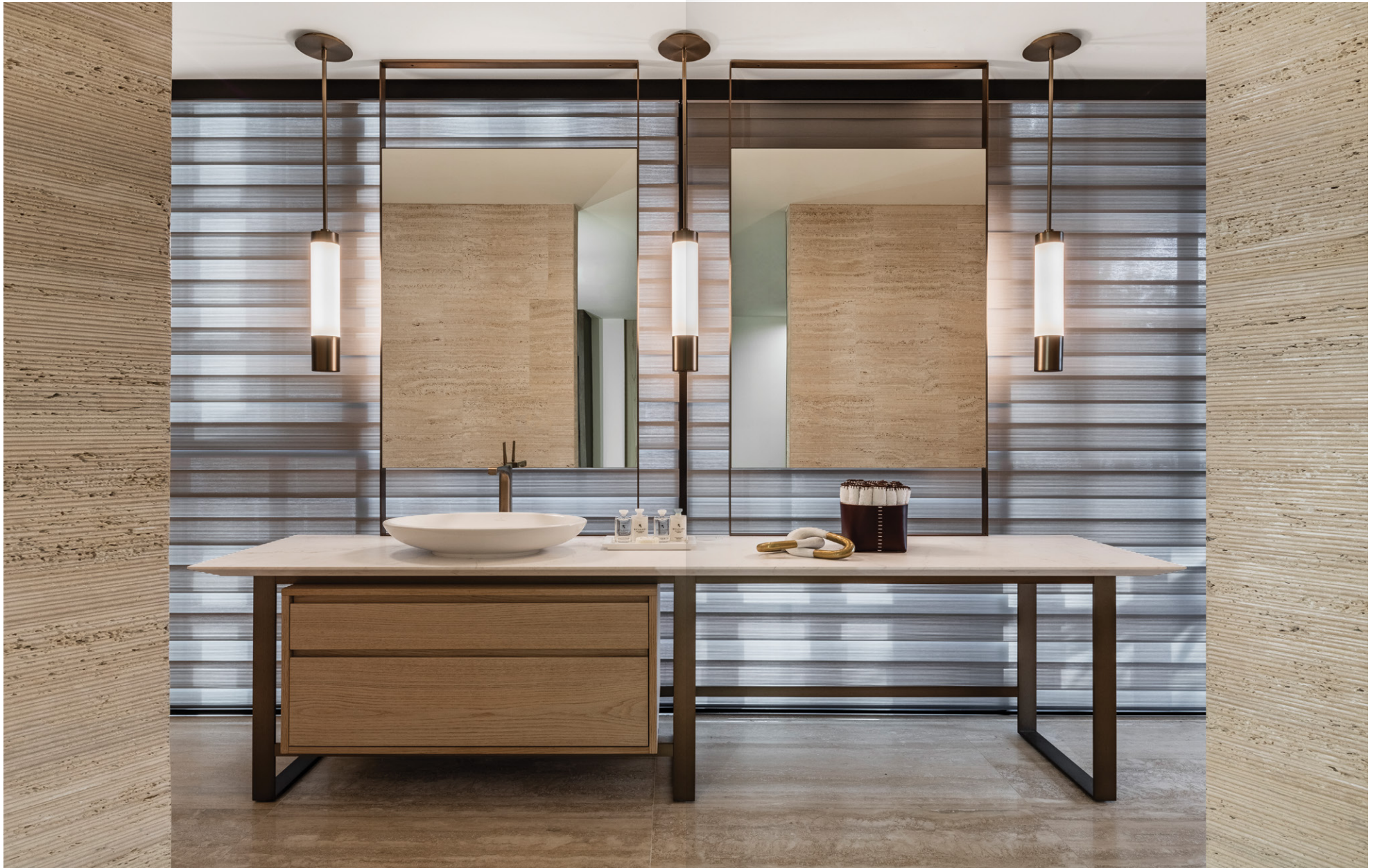
Swaths of nuanced natural stones, Byron marble countertops, custom oak cabinetry and brushed bronze embellishments imbue master bathrooms with an aura of refined relaxation.