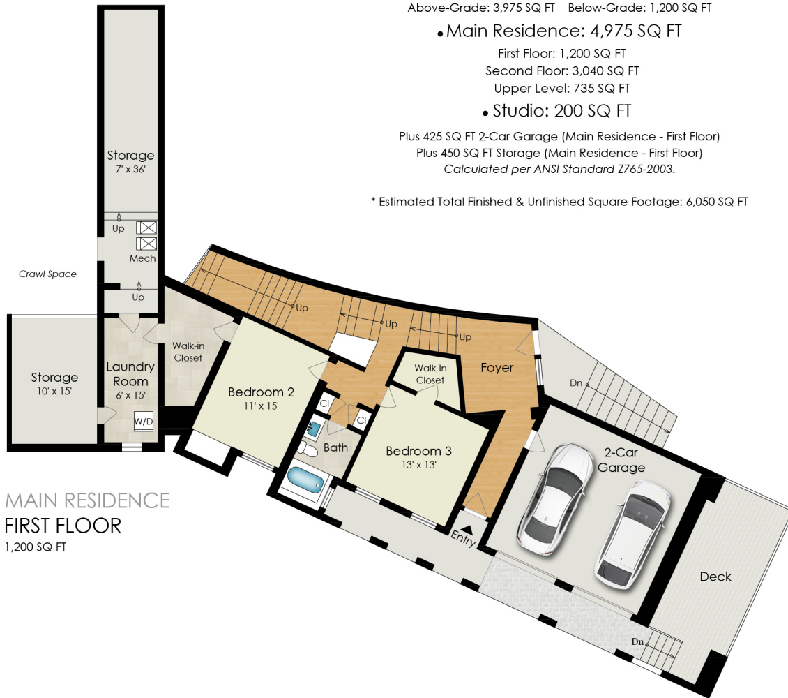
MAIN RESIDENCE FIRST FLOOR 1,200 SQ FT

* Estimated Total Finished & Unfinished Square Footage: 6,050 SQ FT