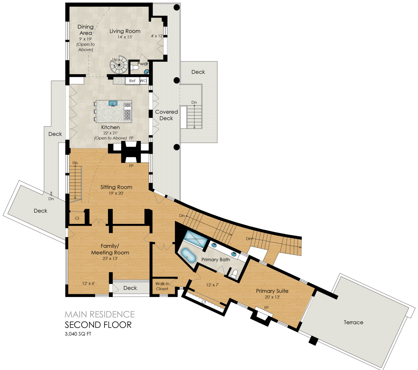
MAIN RESIDENCE SECOND FLOOR 3,040 SQ FT