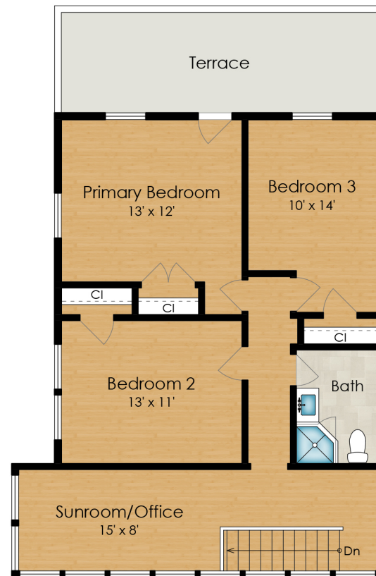
UPPER LEVEL 860 SQ FT