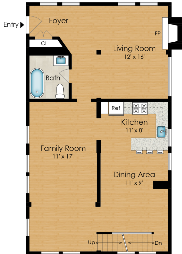
MAIN LEVEL 1,025 SQ FT