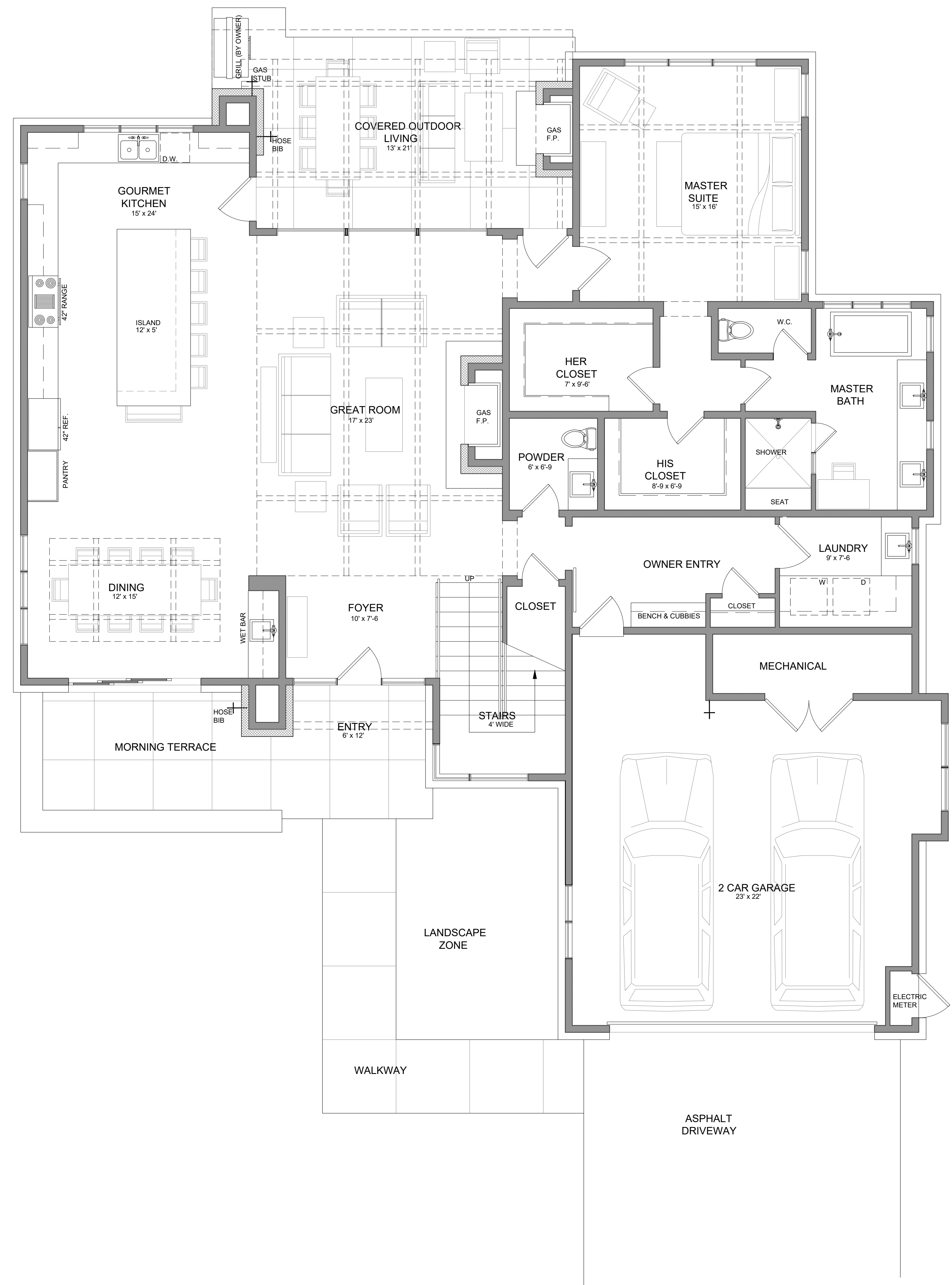
1 MAIN FLOOR PLAN A1.1 SCALE: 1/4"=1'-0"

AREAS: MAIN LEVEL: 2128 SQ. FT. GARAGE: 679 SQ. FT.