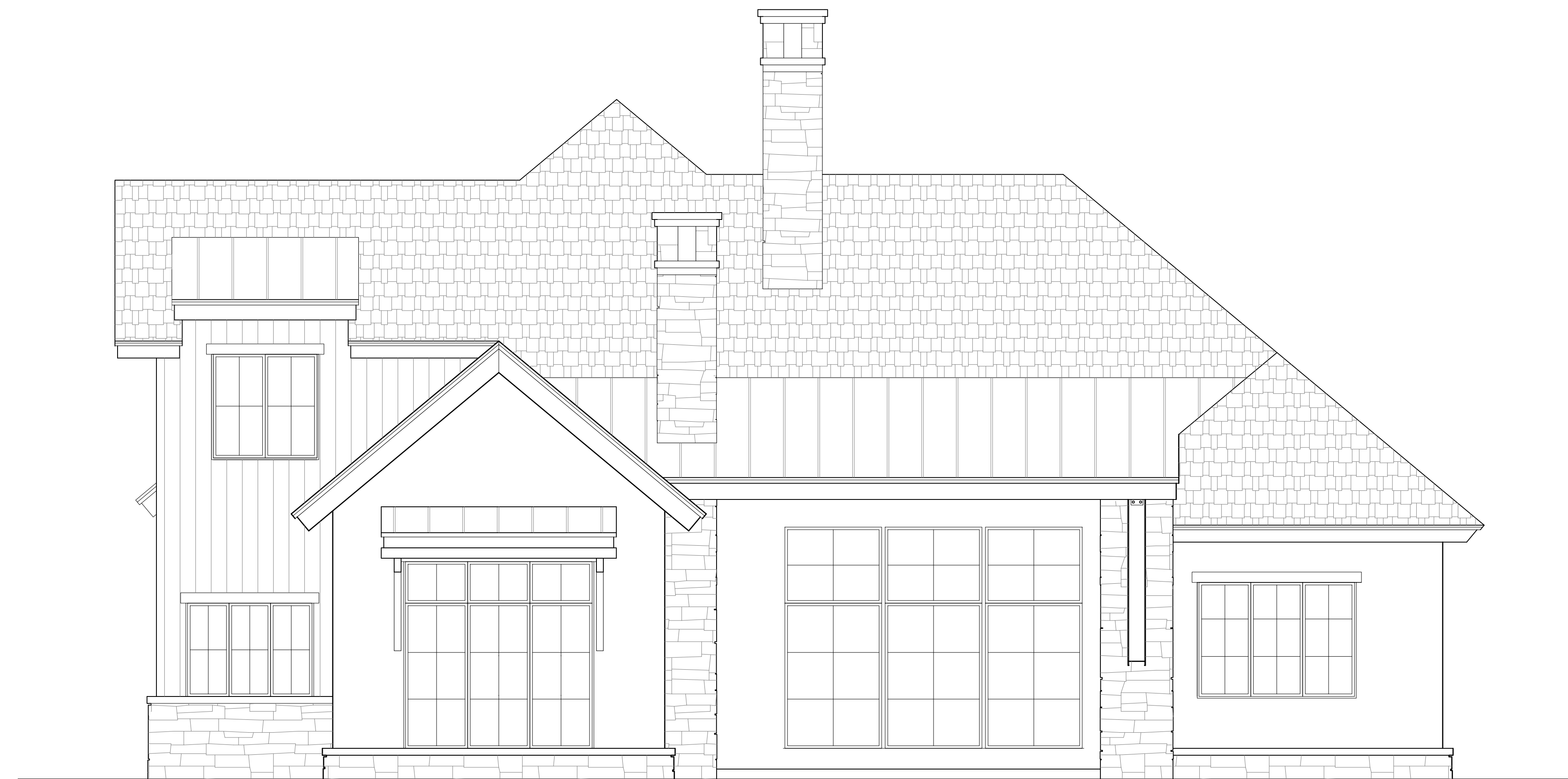
1 BACK ELEVATION A2.2 SCALE: 1/4"=1'-0"

BORGERSON design P.O. Box 66 Eagle, CO 81631 970-376-1972