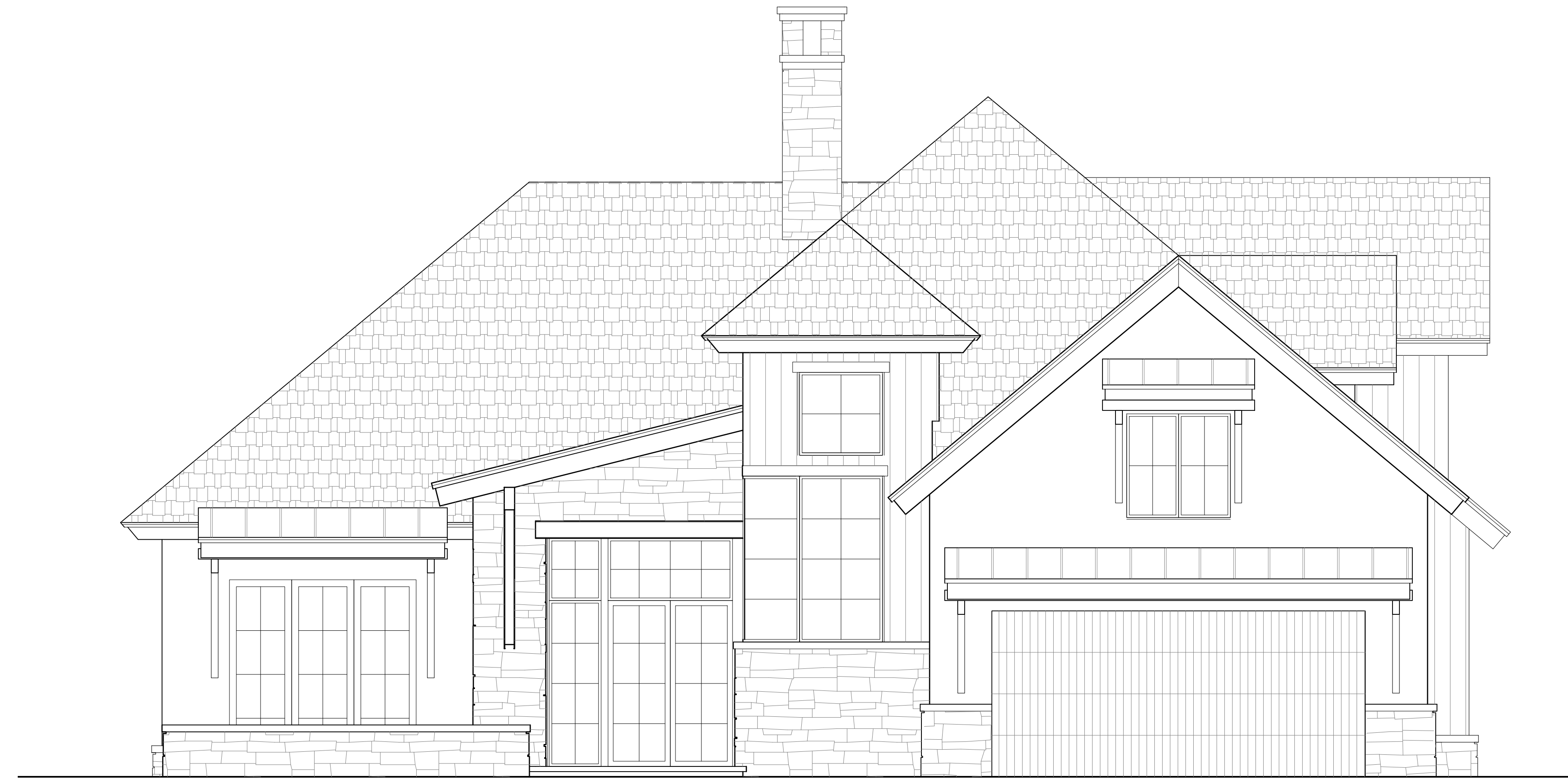
1 FRONT ELEVATION A2.1 SCALE: 1/4"=1'-0"

BORGERSON design P.O. Box 66 Eagle, CO 81631 970-376-1972