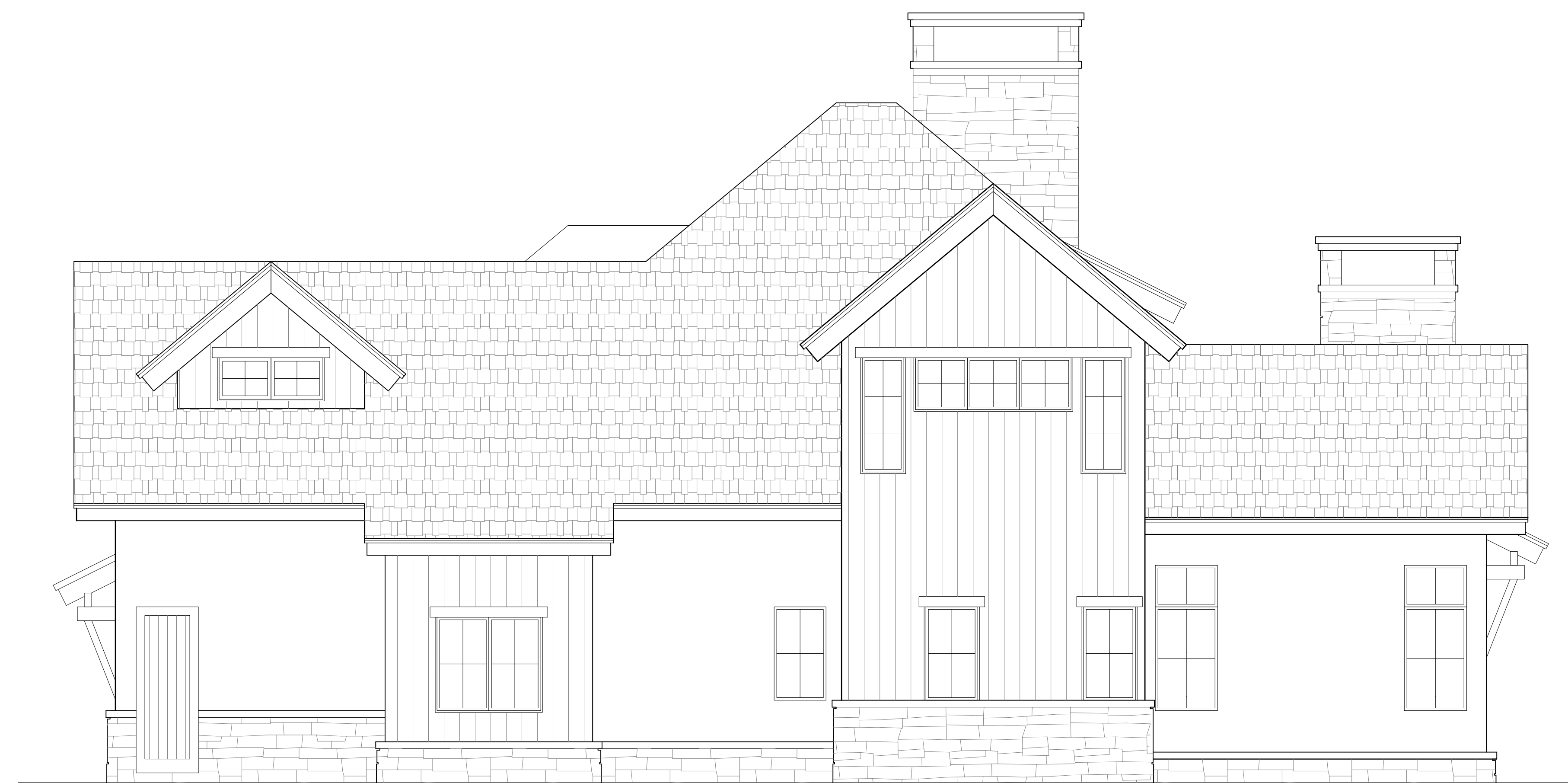
2 SIDE ELEVATION A2.1 SCALE: 1/4"=1'-0"