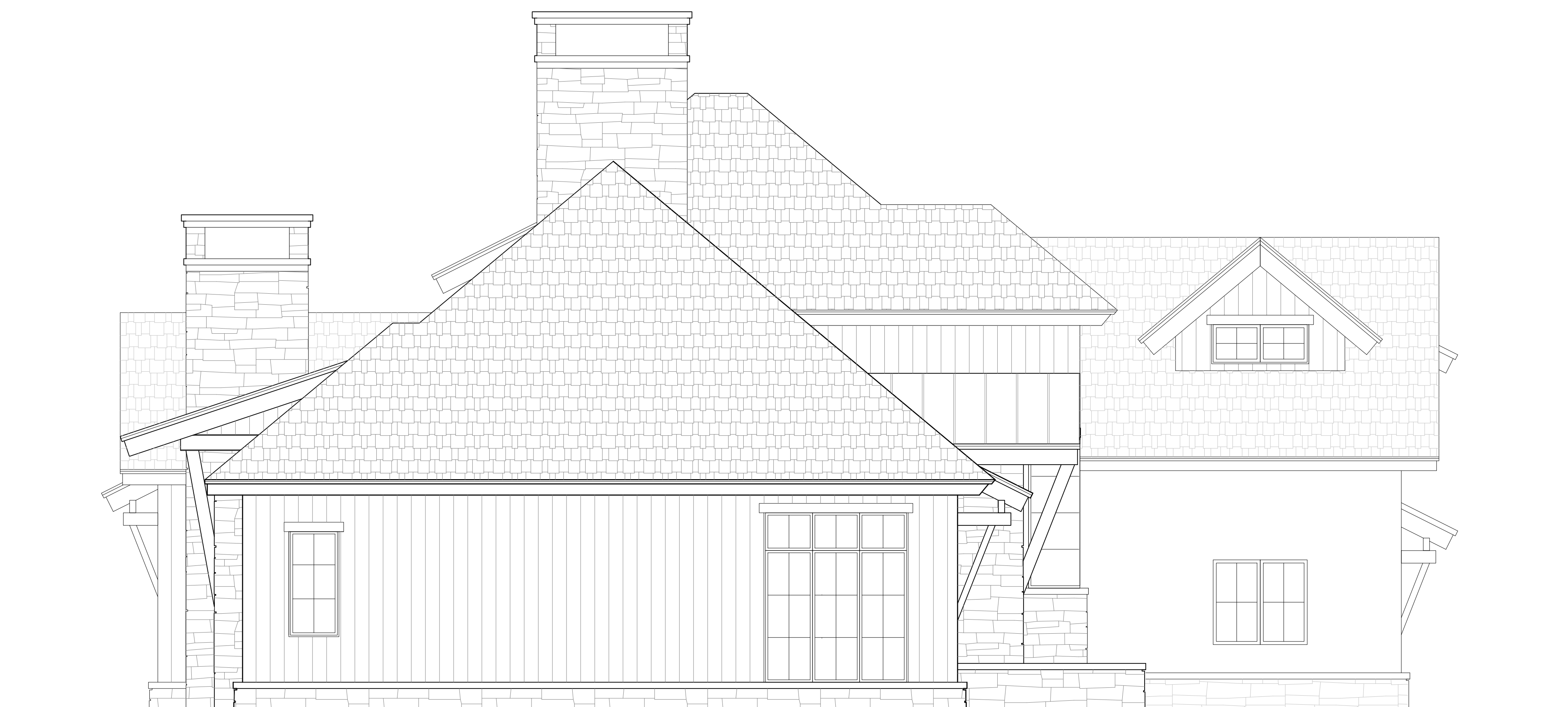
2 SIDE ELEVATION A2.2 SCALE: 1/4"=1'-0"