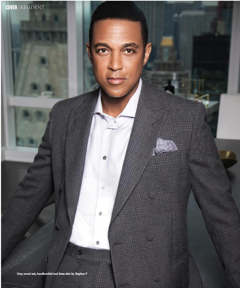
Gray tweed suit, handkerchief and dress shirt by Stephen F