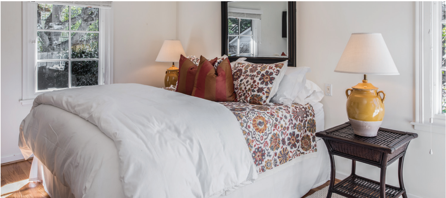
BEDROOM 2 & BATHROOM