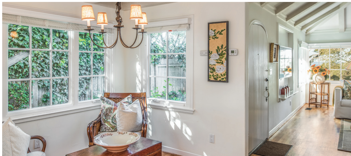
LIVING ROOM & SITTING ROOM