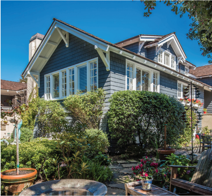
BACKYARD & BASEMENT