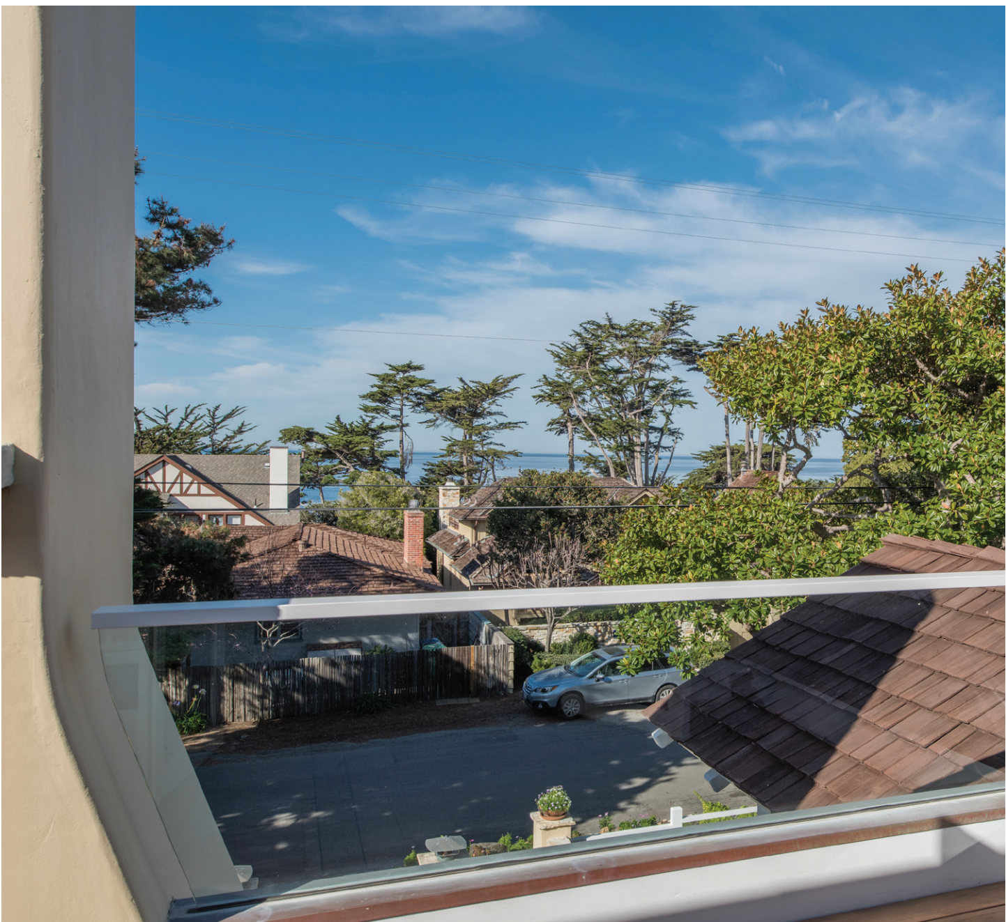
FAMILY ROOM PATIO WITH VIEW