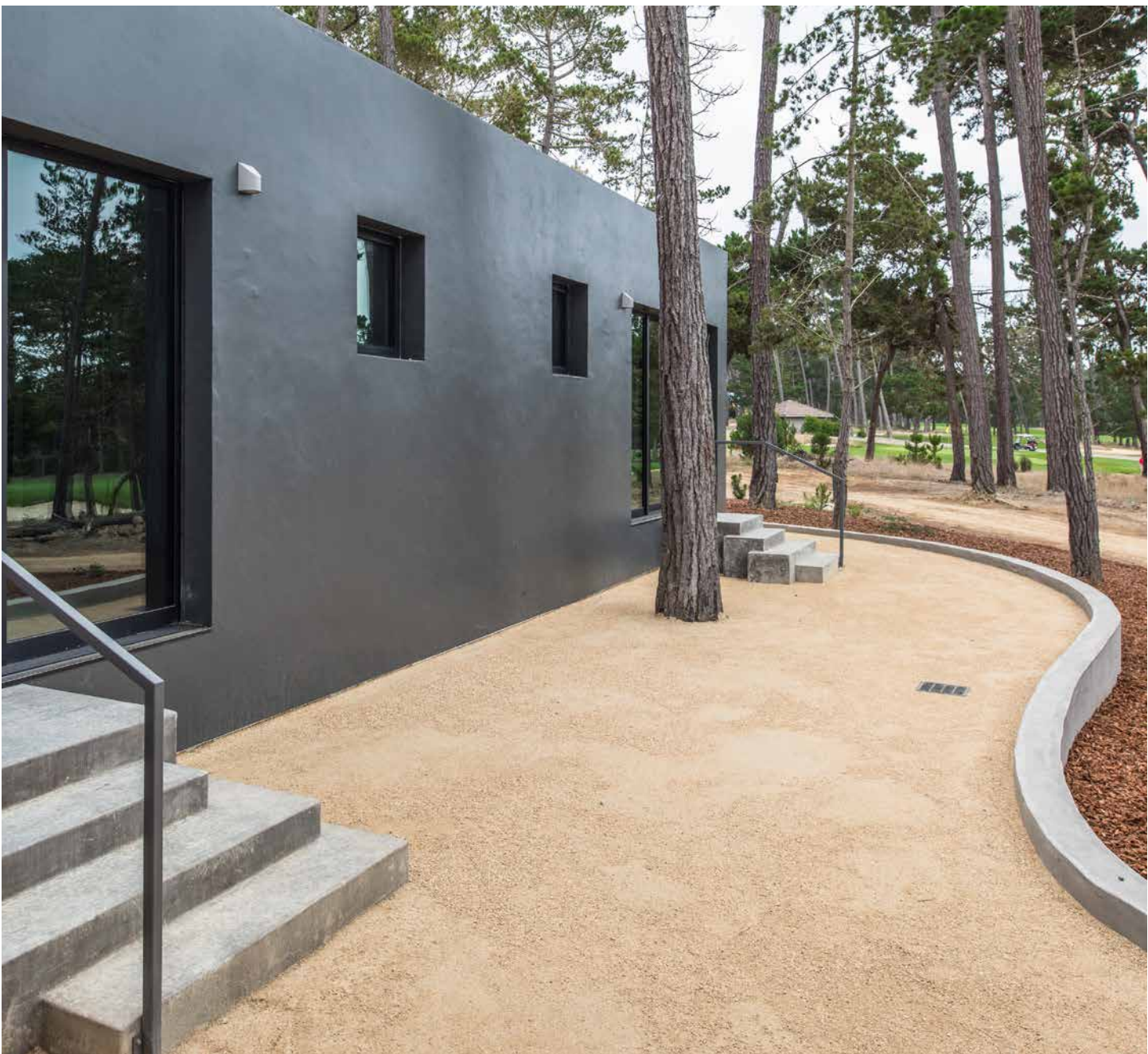
REAR OF HOUSE