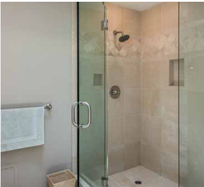
BEDROOM & ENSUITE BATHROOM