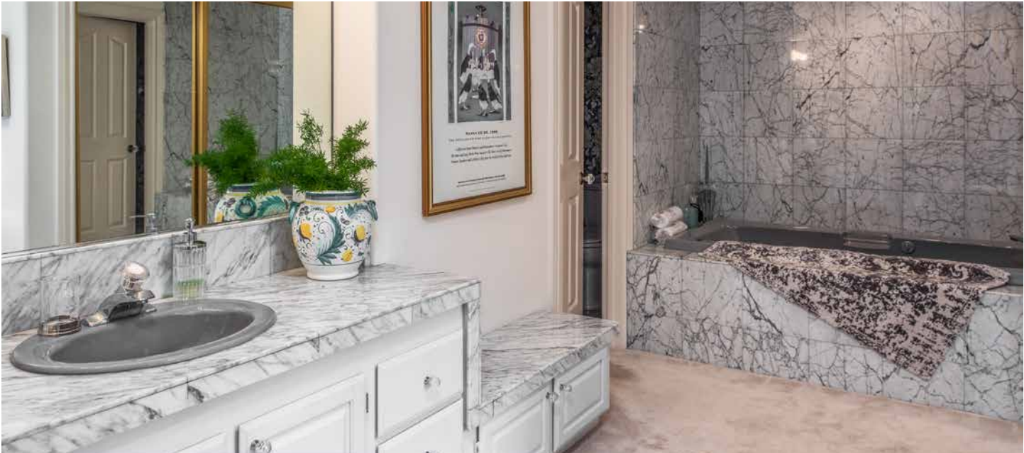
HIS AND HER MASTER BATHROOMS