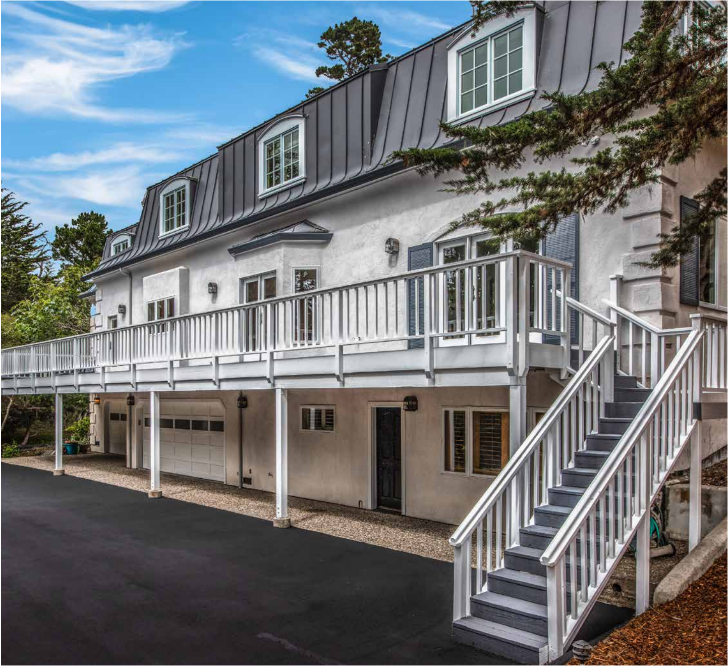
FOUR CAR GARAGE