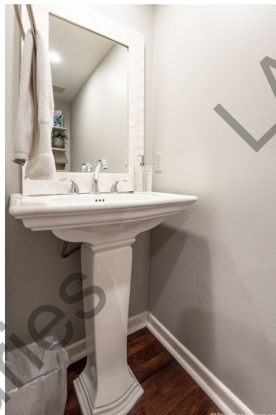
Mahogany wood floors, white walls.