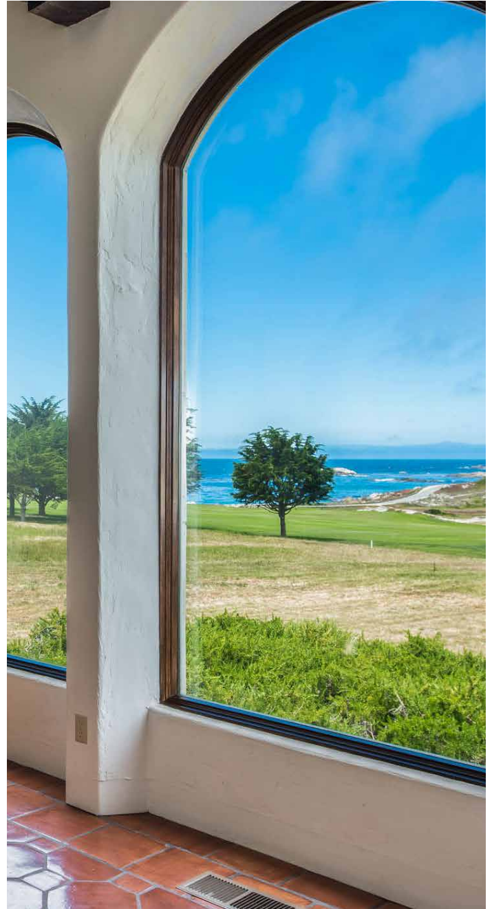
GRAND LIVING ROOM + DINING AREA WITH VIEW