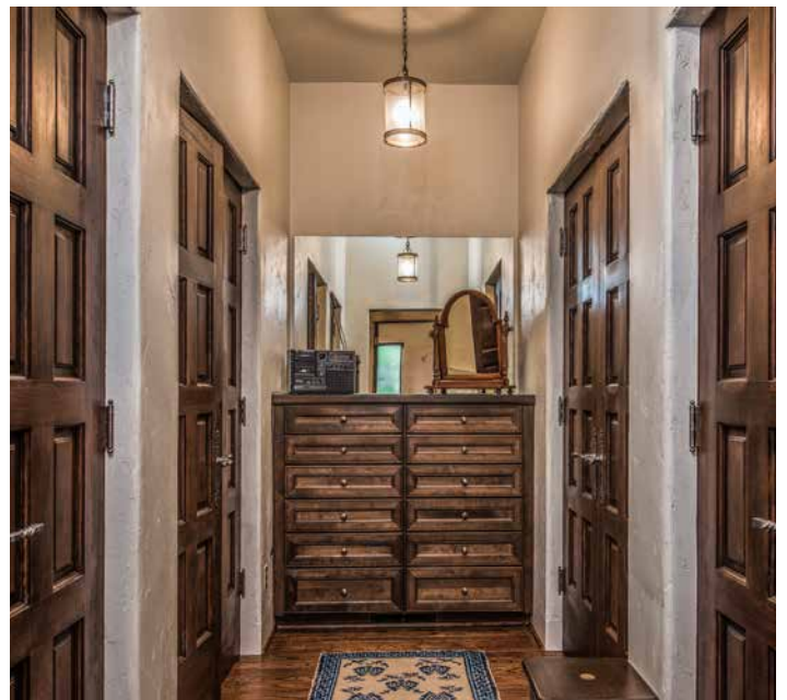
HIS AND HER BATHS WITH CLOSETS